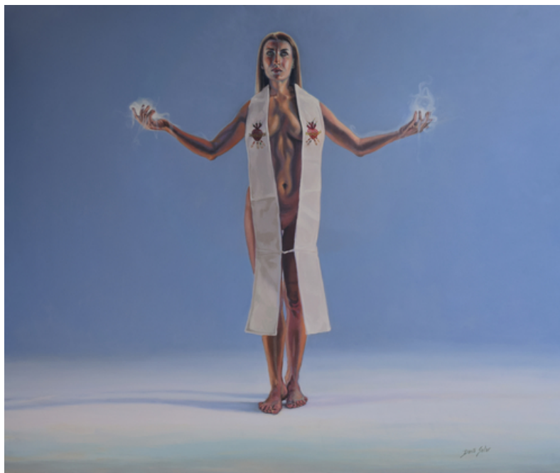
"GMO Priestess" oil on canvas, 120cm x 100cm

The first and most unnerving theme I developed is called "Electric". It is manned with hypnotizing neo-human protagonists. They guide you through the world of technological discoveries, challenges and threats where technology and politics are interwoven into one undistinguishable unity. Most of them are women, whom I relate to and absolutely adore for their subtle, yet versatile power.