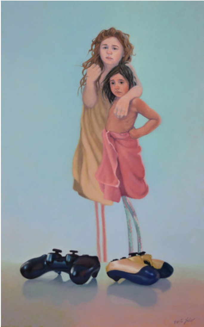
"All Daughters of Lot" oil on canvas, 75cm x 120cm