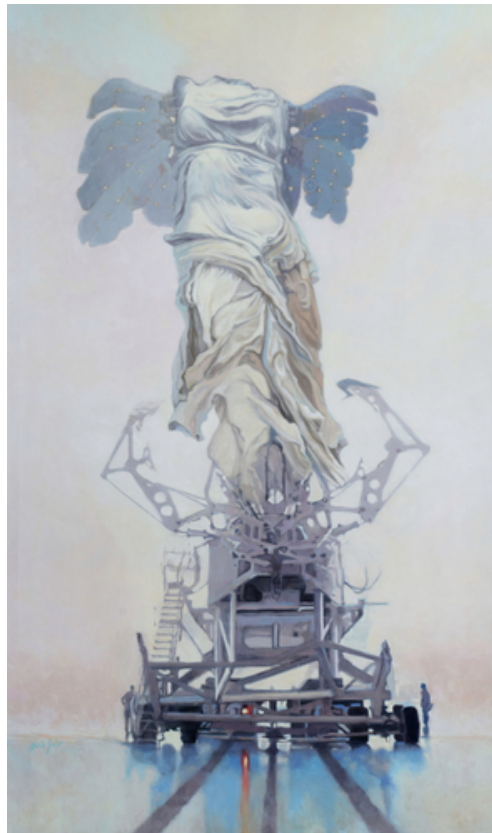
"Nike 2.0" oil on canvas, 120cm x 220cm

I present the gruesome side of technology in a Chinese super-surveillance robot celebrating the Anonymous' death, and a Russian bot slowly but steadily dismantling EU. There are also virtual boy-toy and the girls— independent so far as the cables allow. And a journey to the stars in a NIKE 2.0, SpaceX's winged victory.