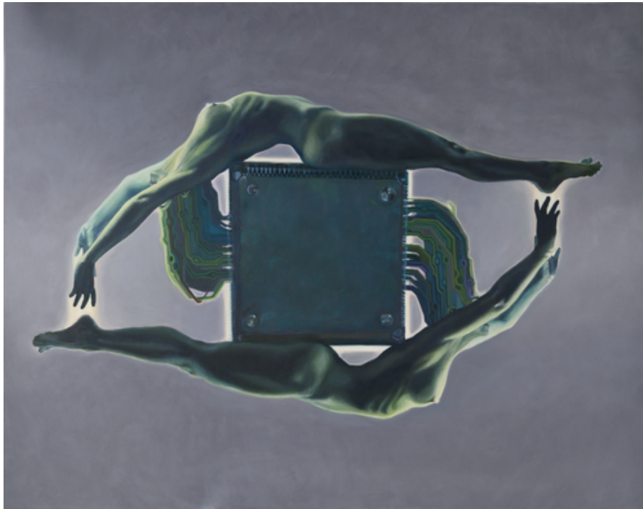
"Circuit" oil on canvas, 100cm x 80cm

The first and most unnerving theme I developed is called "Electric". It is manned with hypnotizing neo-human protagonists. They guide you through the world of technological discoveries, challenges and threats where technology and politics are interwoven into one undistinguishable unity. Most of them are women, whom I relate to and absolutely adore for their subtle, yet versatile power.