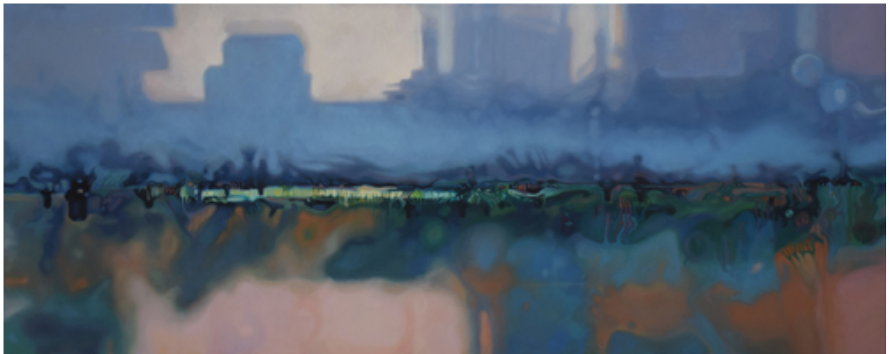
"Metropolis" oil on canvas, 120cm x 60cm

I got the idea to look for inspiration in those boring, buzzing metal boxes when, due to my concern regarding data security, I opened the case of my old computer to remove the hard drive before scrapping it. I saw what was inside and fell in love. Creating these paintings is an excellent escape—a detox and safe haven for me—in which I unwind after the emotional trauma I feel when painting my horrifying, legless cyborgs.