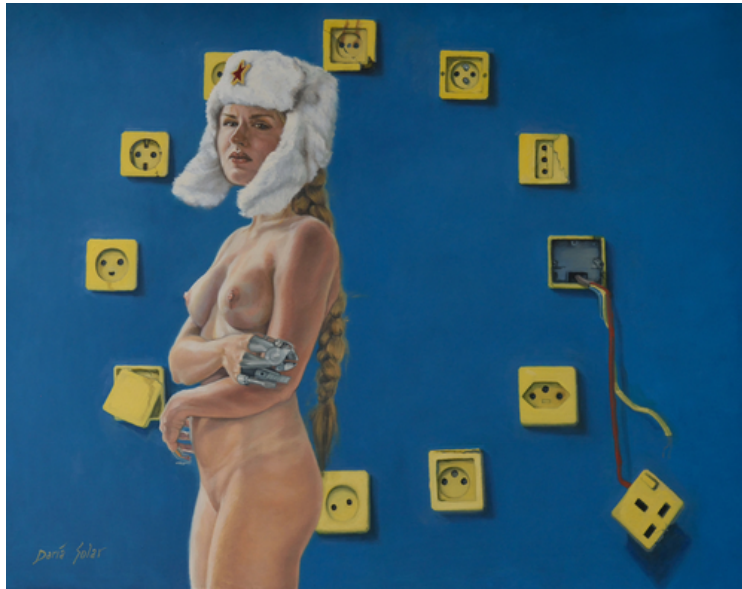
"Brexit Russian Connection" oil on canvas, 90cm x 70cm

I present the gruesome side of technology in a Chinese super-surveillance robot celebrating the Anonymous' death, and a Russian bot slowly but steadily dismantling EU. There are also virtual boy-toy and the girls— independent so far as the cables allow. And a journey to the stars in a NIKE 2.0, SpaceX's winged victory.