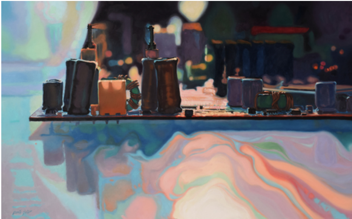
"One Night in Bangkok" oil on canvas, 120cm x 75cm

Another significant theme I explore in my art is an insight into the inner world of computers. Hidden to the human eye exist dusty, mechanical landscapes. These "internal landscapes" (one of which currently displays the very text that you are reading) are meant to enchant and relax.