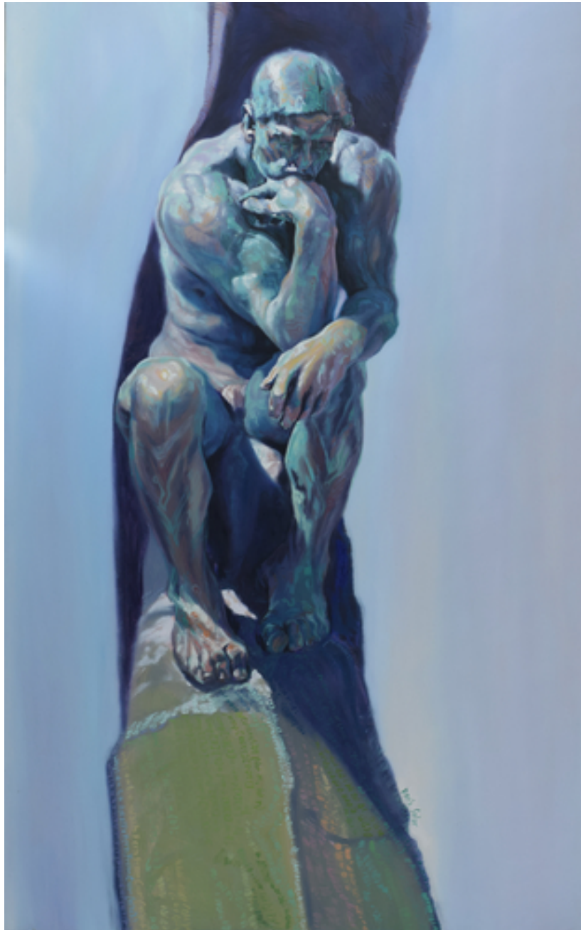
"@ thinker" oil on canvas, 50cm x 80cm